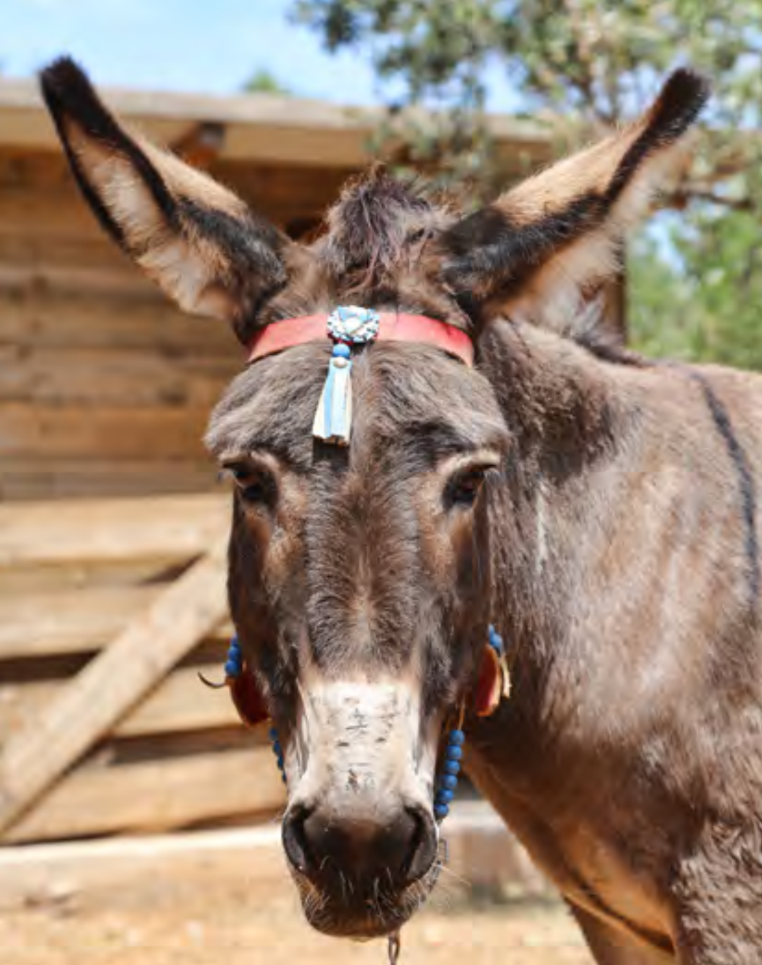
BILLY, OUR RESCUED DONKEY