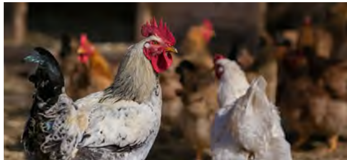
FEED THE ANIMALS!